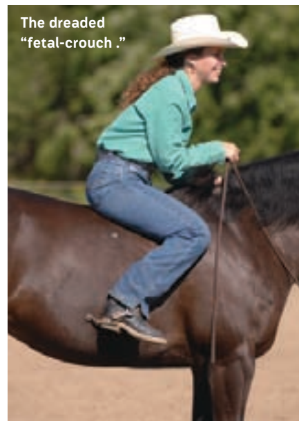
The dreaded "fetal-crouch."

• Use a snaffle. Even though you're not going to be balancing yourself with the reins, outfit your horse in a snaffle bit (or the mildest bit you feel comfortable riding him in) while you're learning to ride bareback. An inadvertent jerk on a leverage bit can cause an abrupt and unexpected reaction in your horse, so this is a safety precaution for you as well as a be-kind measure for him.