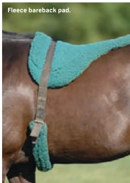
Fleece bareback pad.

When you're ready to try true bareback, warm your horse up in his saddle first, as the sweat will also provide a little extra purchase to help keep you from slipping. (Note that plain water will do the opposite—make his back even more slippery!)