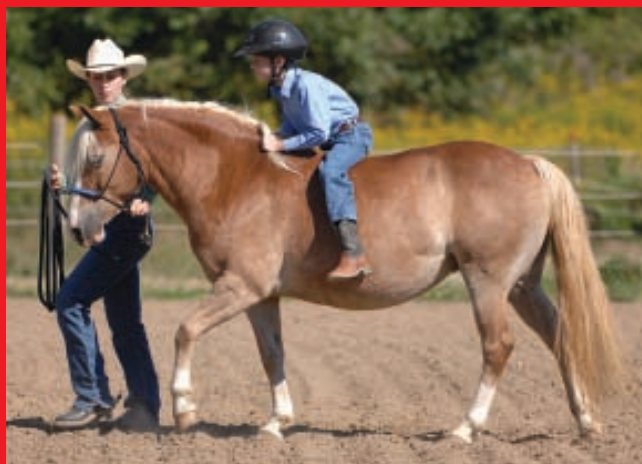
2. Then lean forward, pressing down on your horse's neck as you shift weight onto your hands.