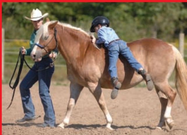
4. ...and over, letting your body slide down as you prepare to push yourself away from your horse...