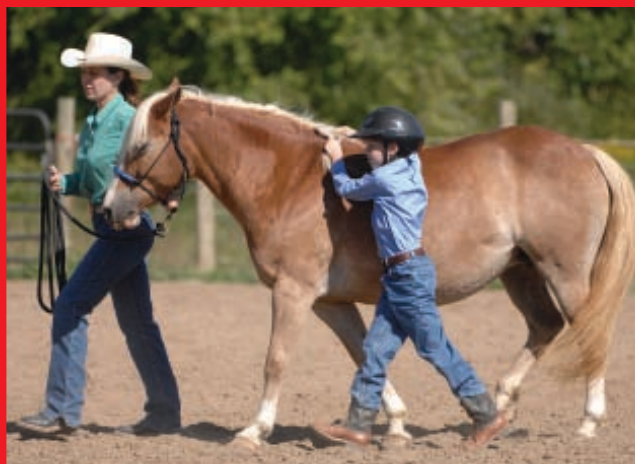
5. ...and twist so that you land on your feet, facing forward and moving at a speed commensurate with your horse's.