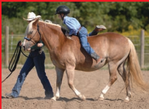
3. Supporting yourself on your hands, swing your right leg up...